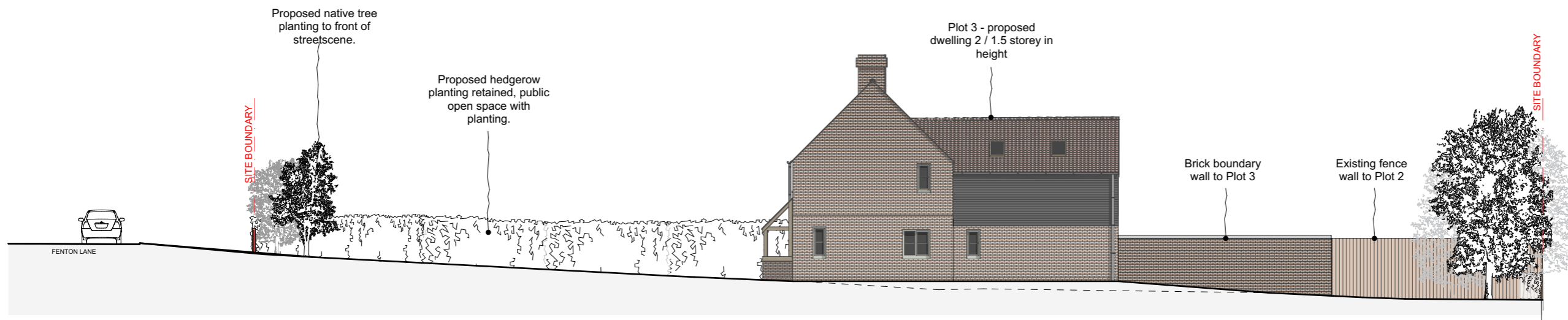
SKETCH SITE SECTION A - A