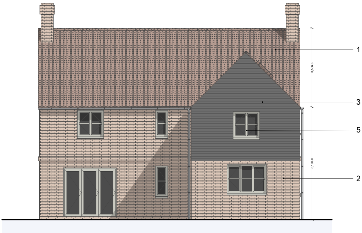
PROPOSED ELEVATION C 1:100