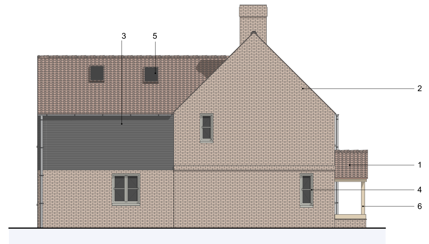
PROPOSED ELEVATION D 1:100