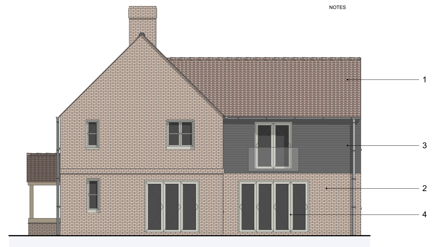
PROPOSED ELEVATION B 1:100