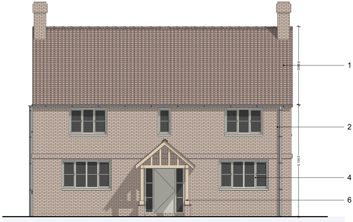
PROPOSED ELEVATION A 1:100