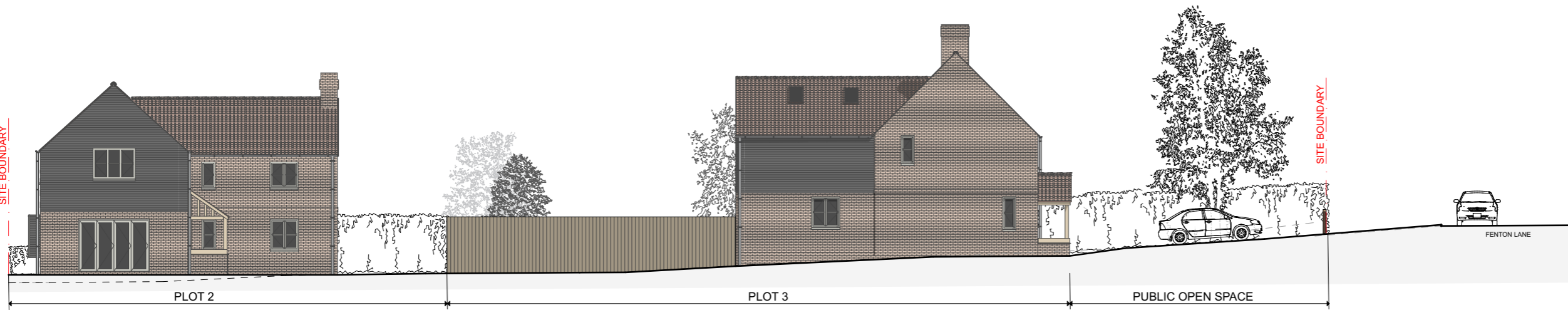
SKETCH SITE SECTION B - B